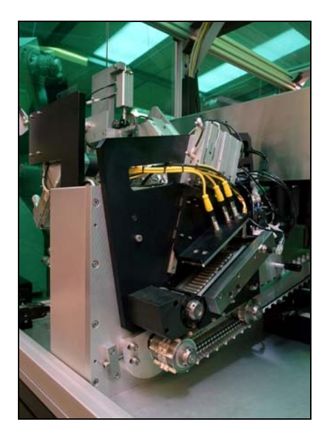
Efficient medical device manufacturing relies to a large extent on the unique design of components and subassemblies. The system above checks the orientation and multiple body features of the components before allowing them to pass into the next stage of the assembly process.

Without focussing on the particular risk factor, this significant improvement to the overall architecture might never have been conceived at all.